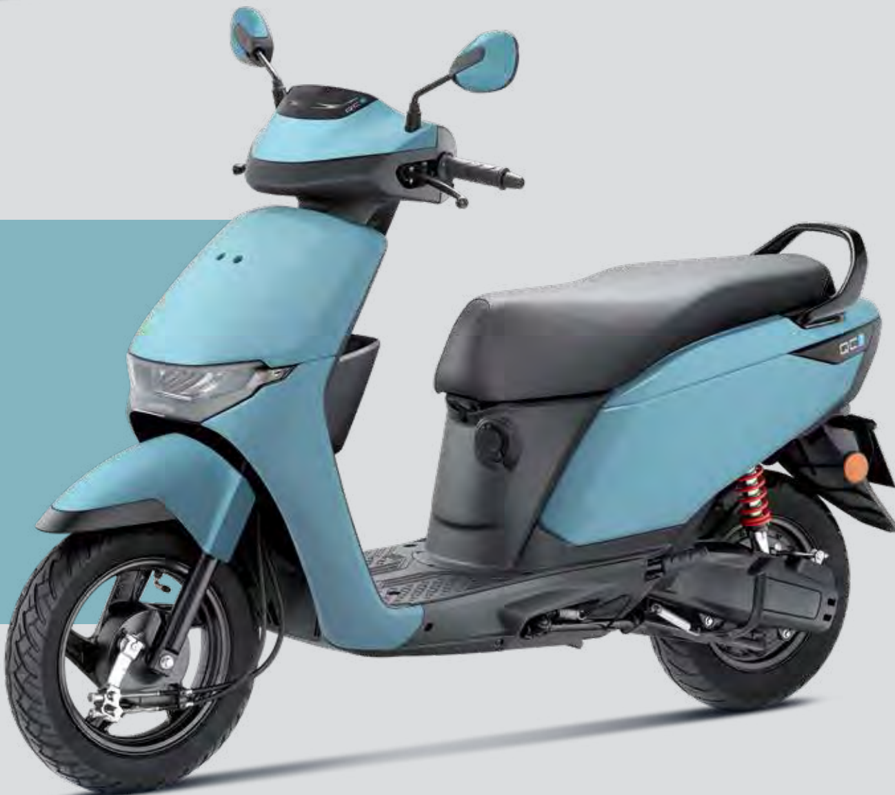
Pearl Shallow Blue