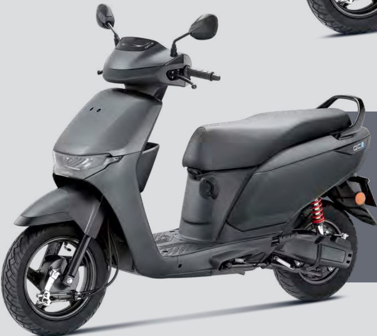
Matt Foggy Silver Metallic