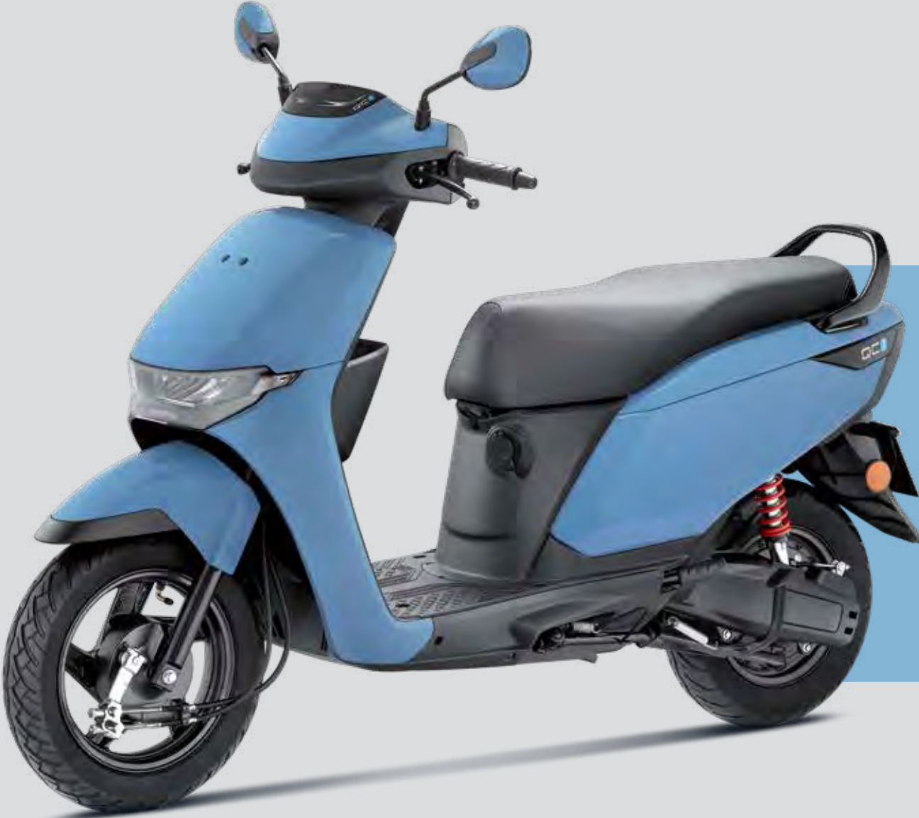
Pearl Serenity Blue

Choose from a range of stunning colours that reflect your personality.