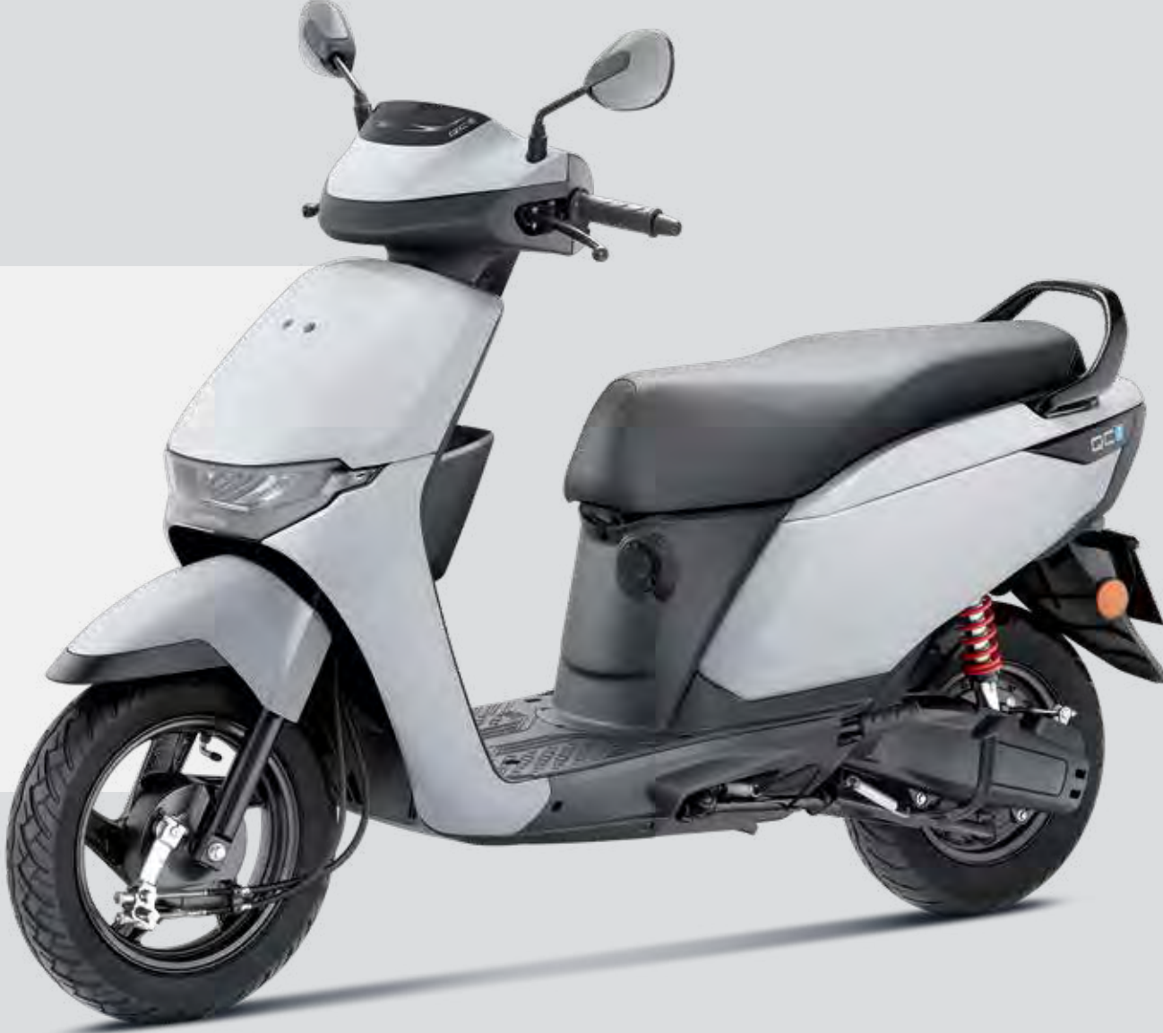
Pearl Misty White